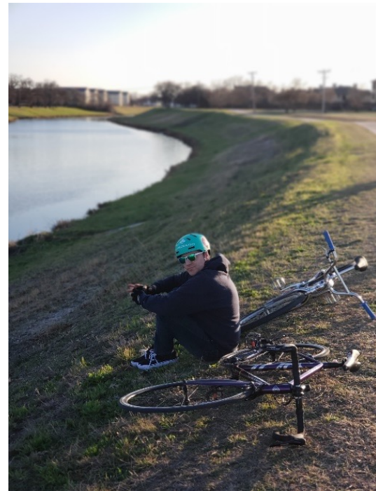
Taking a break after a long bike ride.

After leaving DC, I worked at the California Department of Transportation (CalTrans) as an associate planner, where I focused on systems planning, goods movement, and the development of multimodal facilities, before accepting a senior planner position (Bicycle-Pedestrian) with the North Central Texas Council of Governments (NCTCOG, MPO). There I was instrumental in developing a Regional Pedestrian Safety Action Plan and helped to support the bicycle and pedestrian network within the Dallas-Fort Worth Metropolitan Planning Area. I hold an undergraduate degree in economics and policy from the University of California, Berkeley, and a graduate degree in public administration from the George Washington University, in Washington, D.C.