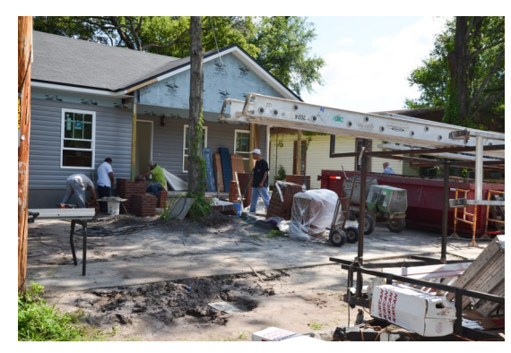
JSEB Staff Members and Others Take a Quick Break After Laying Sod