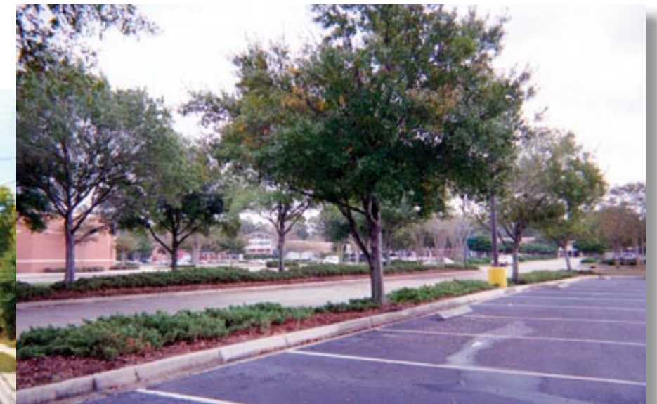
The Suburban Area includes lower density neighborhoods and free-standing commercial areas