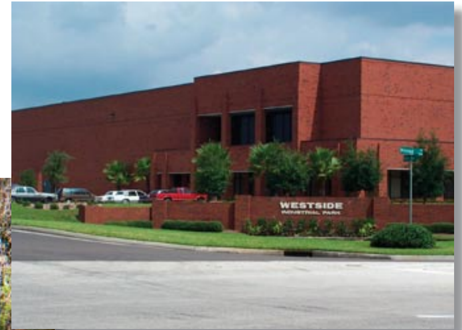
Examples within the Rural/Conservation Area include industrial and recreational lands