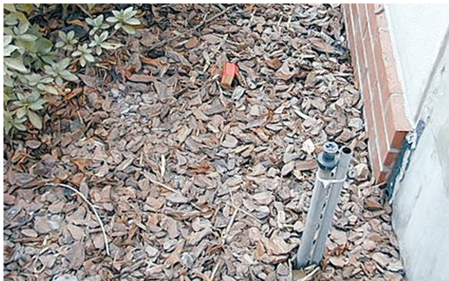
Figure 2. Mulch that is too thick and obscures an inspection space will result in what is termed a “conductive condition” in the pest control industry. Some termite contracts may become void with the presence of conducive conditions around a home. The irrigation head depicted here is in violation of the current building code. The Florida building code requires that irrigation be installed 1 foot or more away from a building sidewall. Irrigation heads that “water walls” is also considered a conducive condition.

Mulch is useful in keeping mud from splashing up against a house. If mulch is part of your landscape, we recommend a thin layer (<2 inches) of mulch be placed within 12 inches of the foundation to allow the soil beneath to naturally dry. Desiccation is the termites worst enemy. Also avoid watering next to foundation walls.