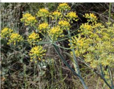
Fennel Seed Structure

Fennel, Foeniculum vulgare , is an herb native to Asia and the Mediterranean. It's an aromatic perennial plant that thrives during the cooler months in Florida. Once the seed is sown it can grow up to six feet in height. Fennel has erect hollow stems and mid-green feathery foliage. It will produce yellow flowers fol-