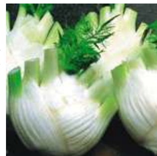
Bulbous Base of Florence Fennel

Fennel in general, grows best in well-drained to sandy soil and prefers a sunny location. Florence Fennel needs a richer but well-drained soil along with plenty of water to create the "swollen" stems.