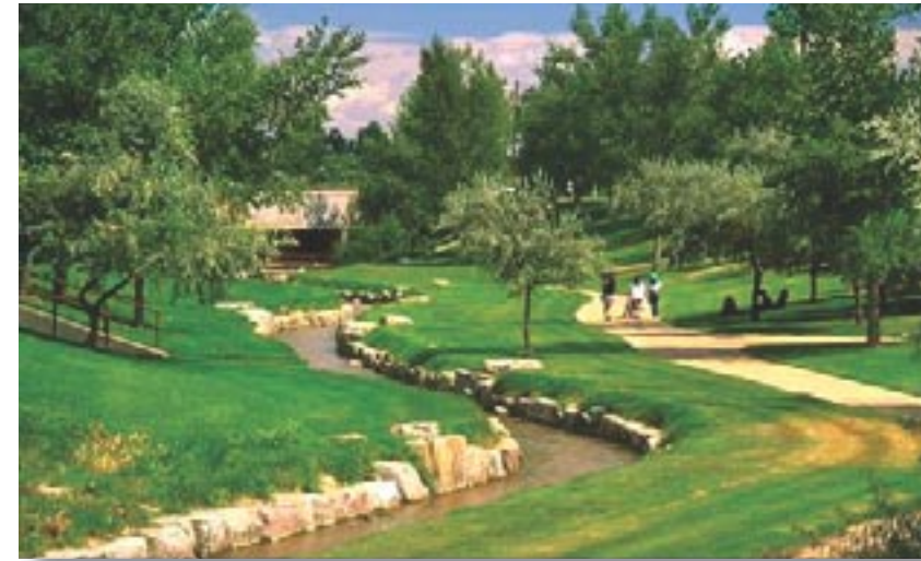
Storm water systems that are part of the natural landscape