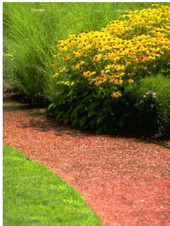
Low impact development techniques include the use of porous surfaces where possible.

The City can support green building practices by rating site plans for their use of storm water friendly and environmentally sensitive measures and then rewarding green designs with a density bonus or similar incentive.