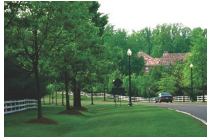
Swales along the road manage storm water while preserving rural character