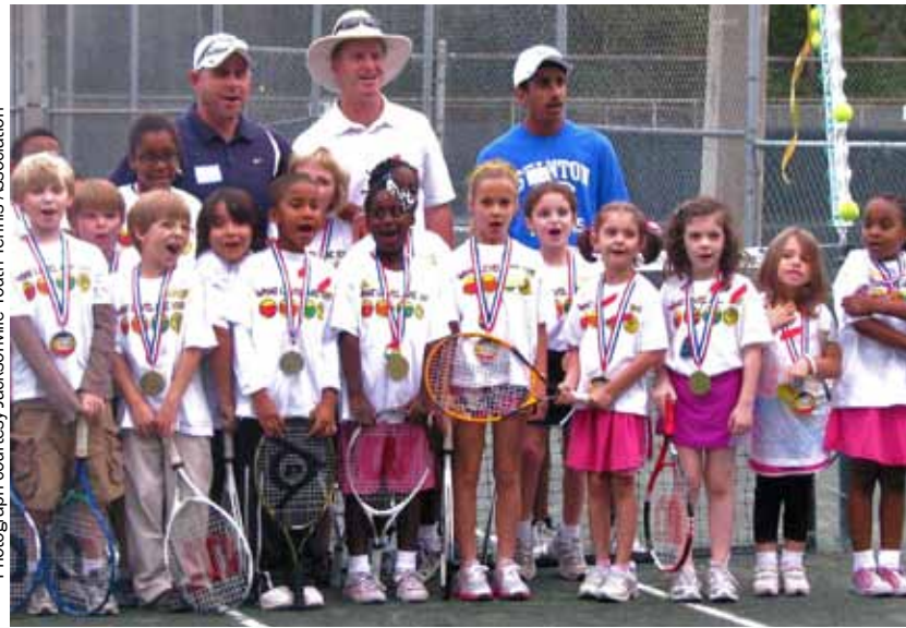
Players and coaches take a break during 10 and Under play day at Boone Park Tennis Center.

The second season of 10 and Under Tennis ended with a celebration at Boone Park Tennis Center for participants and their families. The program will return to JaxParks spring 2012.