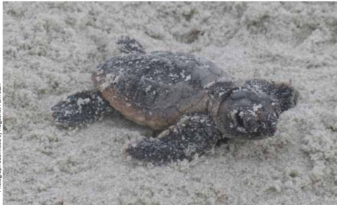
Baby Loggerhead Sea Turtle on the beach at Huguenot Park

The park also recorded a record number of 19 Loggerhead Sea Turtle nests this year; five more than any other year. More than 1,400 of the hatchlings made it to the Atlantic Ocean.