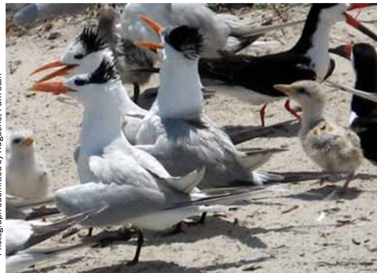
Royal Terns (adults and chicks) at Huguenot Park