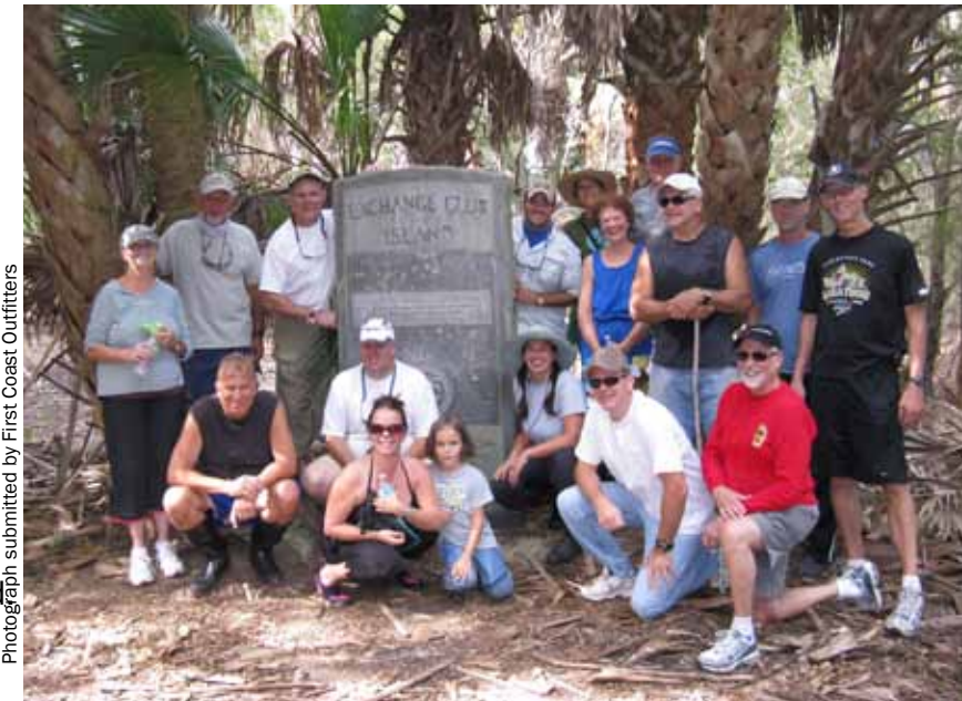
Volunteers collect trash and other debris at Exchange Club Island

A new educational kiosk also opened at the park this fall, providing visitors with information about wildlife, safety, park rules and maps.