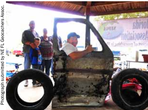
Northeast Florida Geocachers Association volunteers show off their "find" at Ringhaver Park.

Twenty-one volunteers collected 35 bags of trash and recyclables in addition to a tire and washing machine parts at Exchange Club Island. First Coast Outfitters led the island cleanup under the Matthews Bridge.