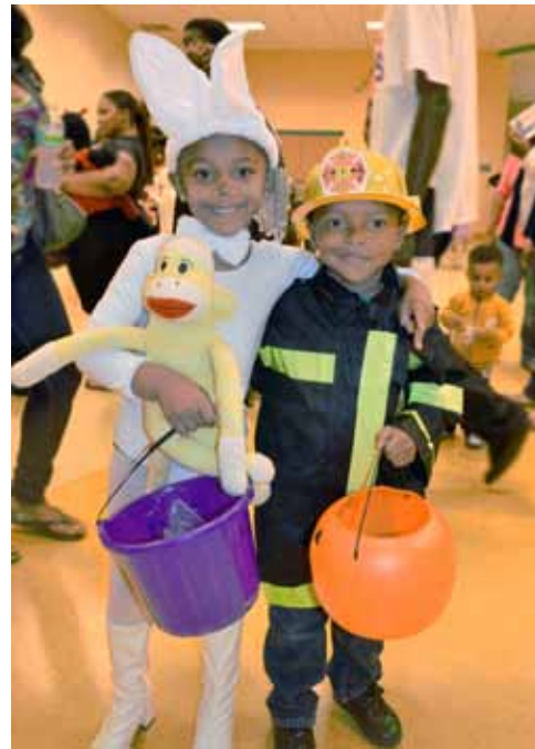
Trick-or-treaters at the Jacksonville Giants Fall Festival show off their costumes.