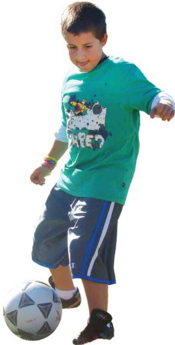
Blue Cypress Homeschool Recreation