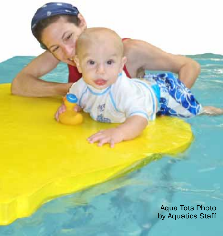
Aqua Tots

For more information, contact JaxParks Aquatics