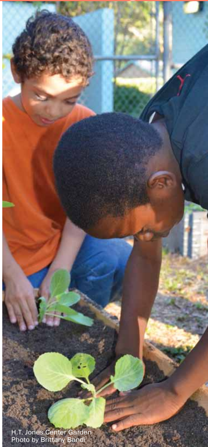
H.T. Jones Center Garden