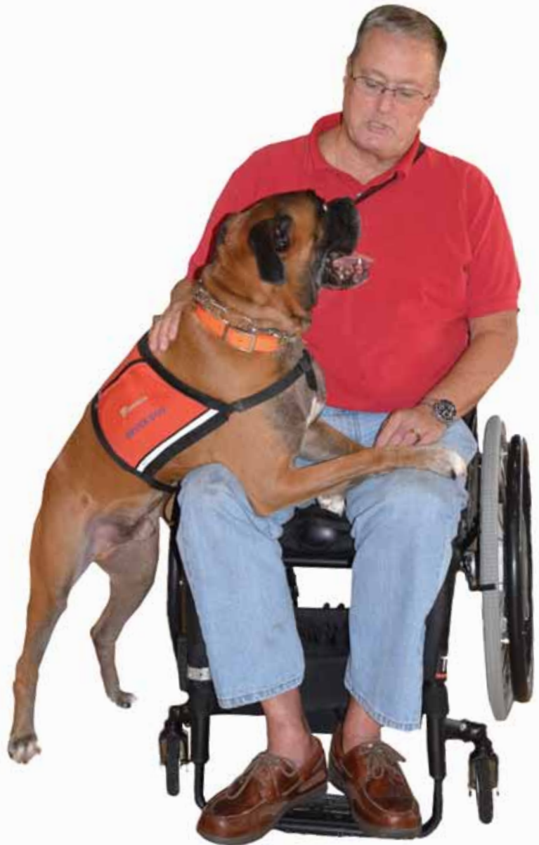
Service Dogs Program at Bethesda Park