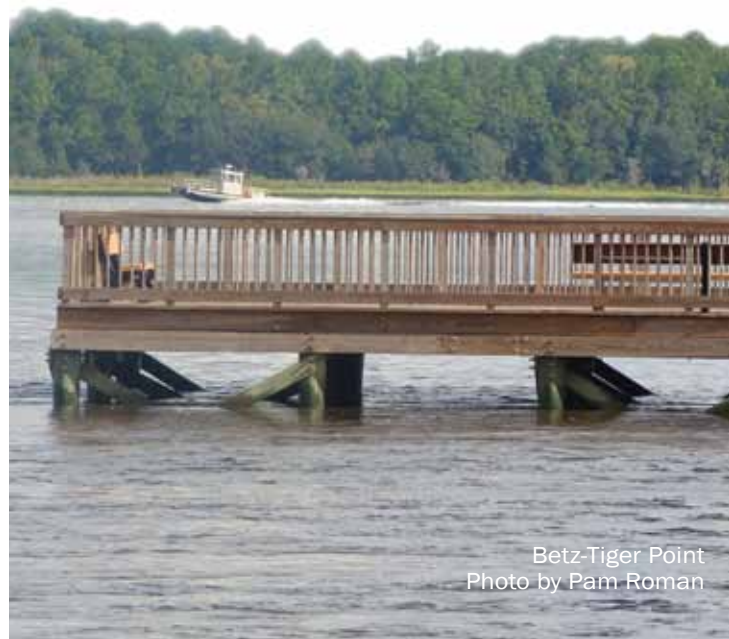
Betz-Tiger Point

Sal Taylor Creek Preserve** 2:30 - 3:30 p.m.