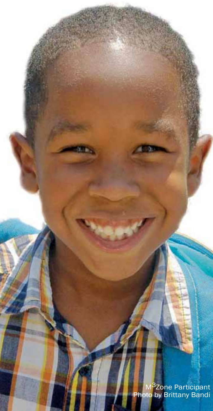
M 3 Zone Participant