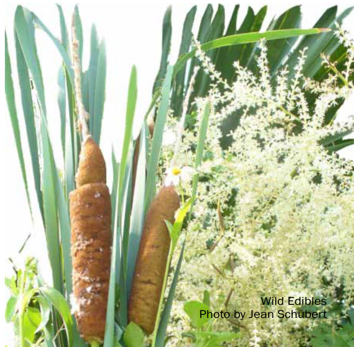
Wild Edibles

+ Restrooms may not be available at all facilities.