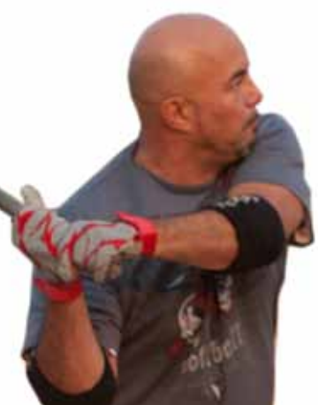
Adult Softball League Play

For more information about JaxParks adult athletics programming, call (904) 255 - 7928.