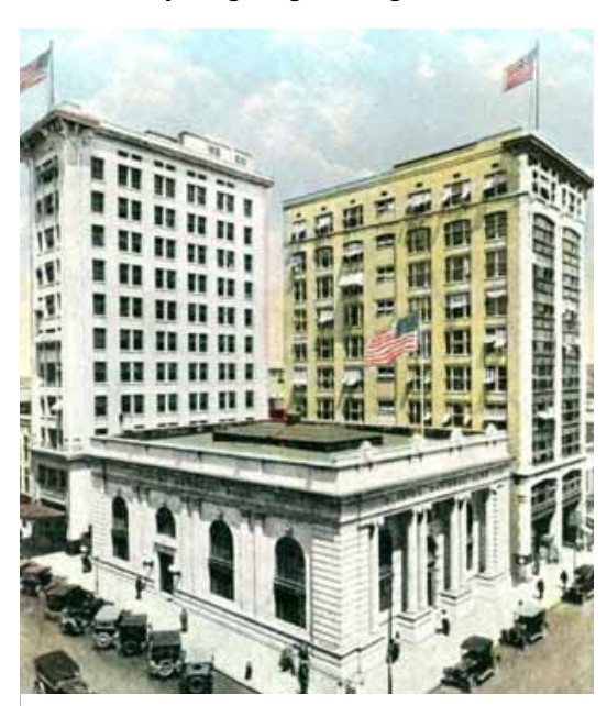
The Florida Life Building, the Old Florida National Bank Building, the Bisbee Building

It was also concluded that proposed new survey boundaries should be expanded to cover the downtown area as defined by the Downtown Development Authority (DDA) boundaries. Additionally, the scope needs to be increased to include nominations for historic districts and individual sites. Addressing both districts and individual sites would open these historic properties up to the federal and state incentives and save developers and owners the time and money of going through the nomination process to make them eligible.