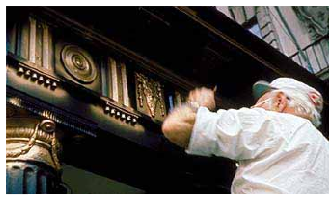
Repair of a decorative cornice.