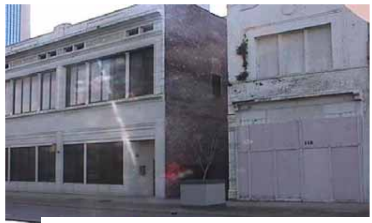
The rhythm of ground floor windows are an important aspect of an inviting streetscape