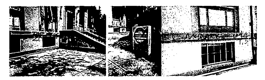
Work has been occurring although you may not have noticed....

It is with a sad heart that we found our Willowbranch Library the victim of vandals. JPL has reported the crime to JSO who are taking appropriate action. Additionally we are making a claim to COJ - Risk Management to help in addressing the cost of repairs. The spray paint is mostly on the original building where extensive pressure washing may damage the stucco, so we are obtaining quotes to paint the areas with the appropriate coating required for the building. We hope to have the work done as soon as possible. In the meantime, the video cameras on the building are being monitored and if you have any information regarding this crime please contact JPL or JSO.