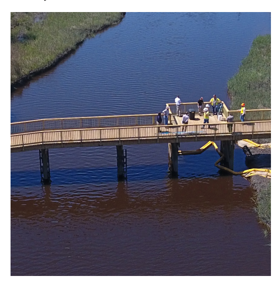
The pedestrian bridge under construction.

The completion of the bridge project marks the last major hurdle to connect the trails on five adjacent conservation lands totaling 5,526 acres managed by the City, NPS and FPS and seamlessly connect nearly 28 miles of trails in northeast Jacksonville.