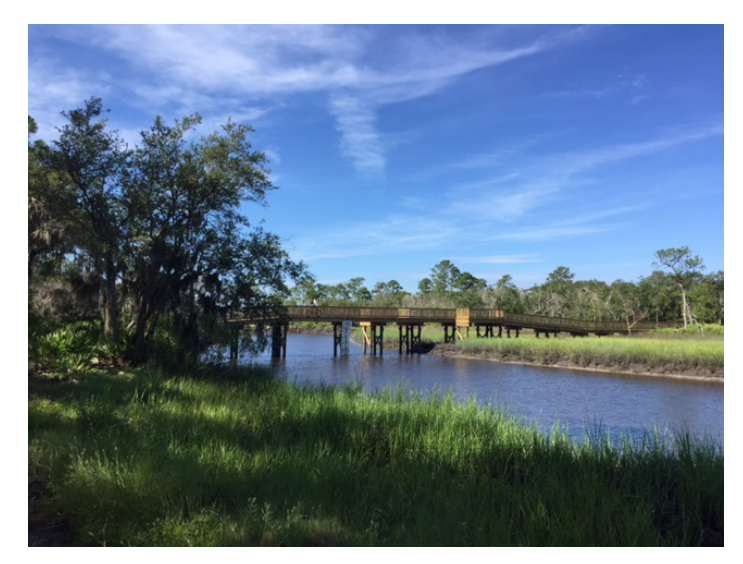
View of the completed pedestrian bridge connecting Cedar Point Preserve to the National Park Service's Timucuan Ecological and Historic Preserve.