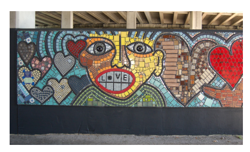
(Above) This "Love Graffiti" mosaic mural along the S-Line Rail Trail memorializes a graffiti image that once appeared where the moasic hangs today.

(Left) Emerald Trail Logo. The planned Emerald Trail network will connect at least 14 historic neighborhoods.