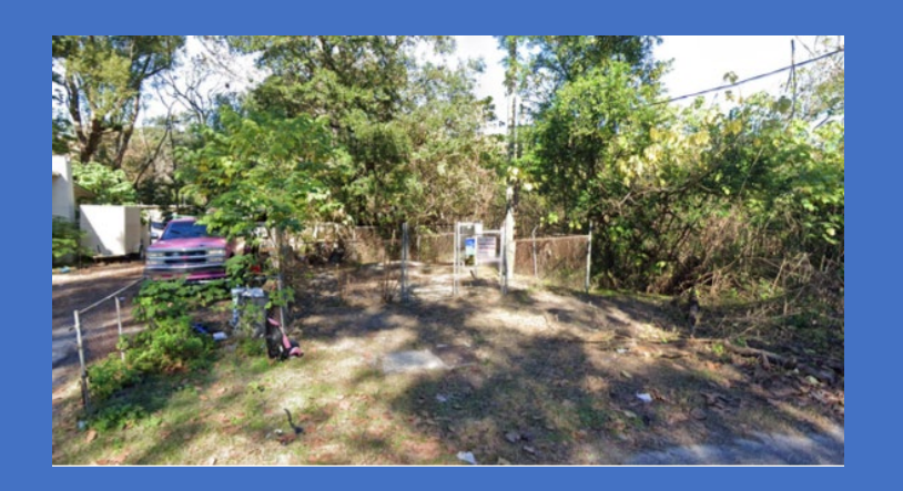
Hilly Road Pump Station