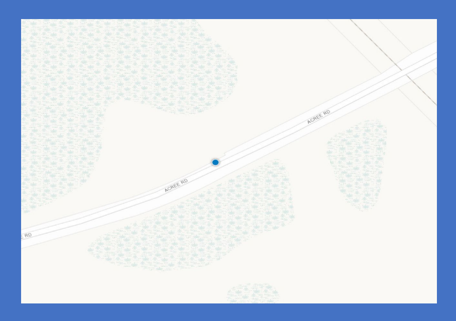
ADDRESS: 9501 Acree Road Jacksonville, FL 32219

<u>DESCRIPTION</u>: The existing three bridges are showing signs of softening and deterioation at a rate of increasing occurrence due to the age of the structures. Continued maintenance on the bridge requiring road closures will make their replacement a more cost effective option.