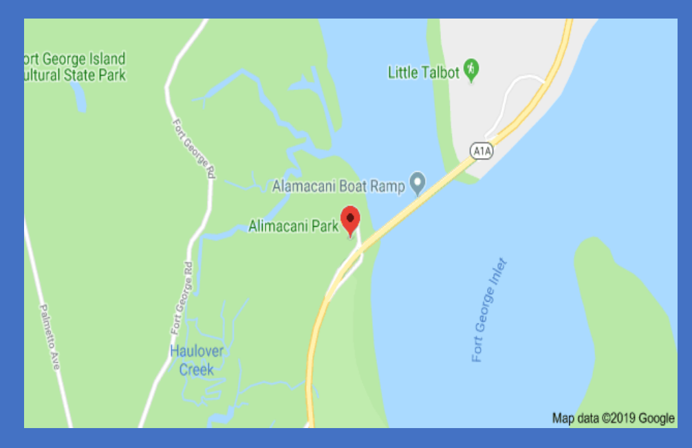
ADDRESS: 501 East Bay Street Jacksonville, FL 32226

<u>DESCRIPTION</u>: The purpose of this project is to ensure that all public safety personnel have a safe place to work from before, during and after a natural disaster. The current genreator failed its operational-load testing in 2016, which required Public Buildings to install a temporary rental generator to ensure continuity of severive of the City's 911 Call Center and Police operations.